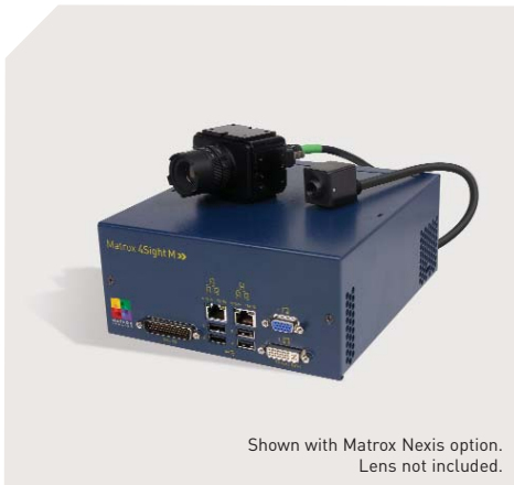
Shown with Matrox Nexis option. Lens not included.

Third-generation compact industrial imaging computer.